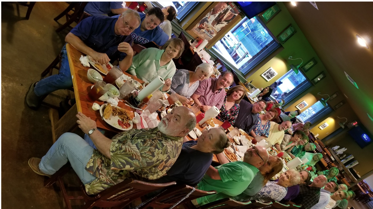
The KHCC Pioneer Class enjoying dinner and fellowship this past Friday.