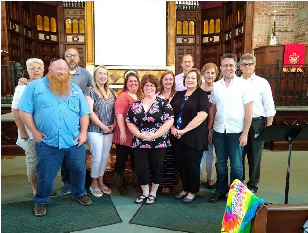
Contemporary Worship "Camp Sunday" Some of the "old" campers & sponsors.