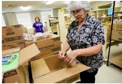
Food Pantry donation baskets are located in the church office and Welcome Center.