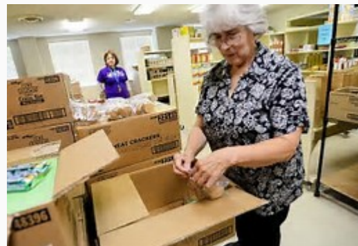
Food Pantry donation baskets are located in the church office and Welcome Center.