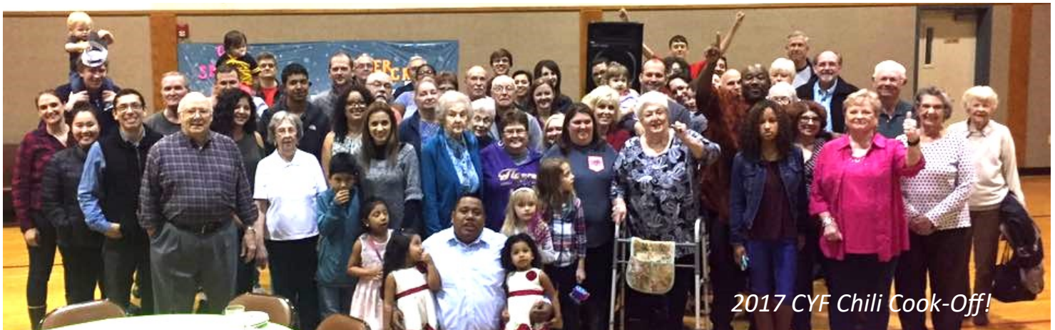
2017 CYF Chili Cook-Off!

Any adult wanting to be a counselor this summer will need to fill out a Camp Counselor Interest Form and attend a mandatory one-day training in Athens in March. Please contact Becky Flippo if you are interested (318-780-0762).