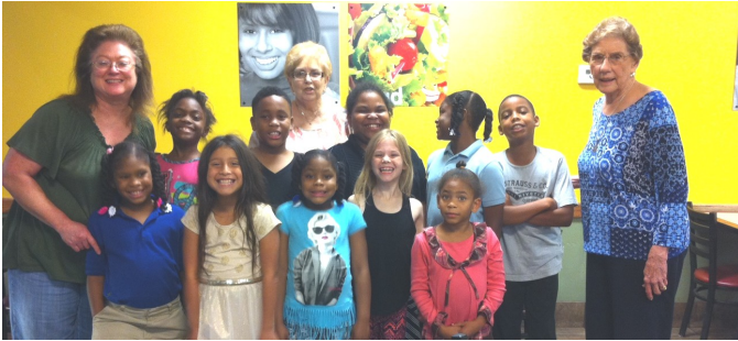
KHCC Outreach taking Community Renewal Friendship House children to celebrate their good grades to CiCi's Pizza.

The Noel Food Pantry needs items for their Thanksgiving bags. You may drop items at the church in the baskets marked Noel Food Pantry Donations.