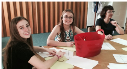
CYF working with "The River" kids.