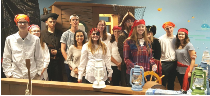
CYF as Pirates for Fall Festival 2016 Haunted House