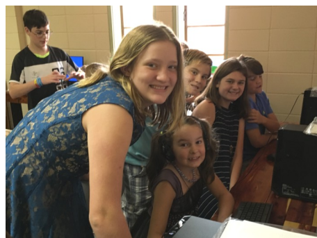
Chi Rho kids help "The River" kids work on new computer programs.