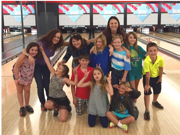
JYF Kick-Off Bowling Party this past Sunday.