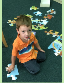
FUN AT "THE RIVER"