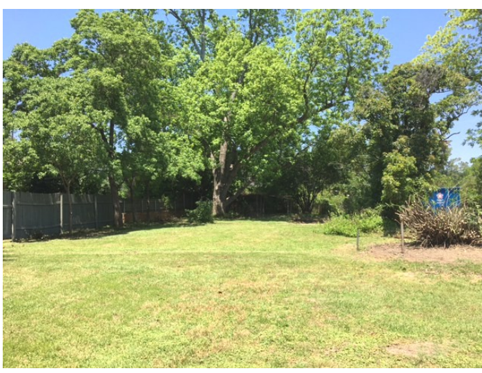
This is the result of One Beautification Play Day.

Next Church Wide Beatification Day will be tentatively June 4th, 8:00 am - noon.