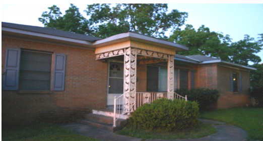
"House of Hope"

Donations from the dinner will go to Casa Esperanza "House of Hope" the wonderful ministry we have here at Kings Highway Christian Church. Casa Esperanza is a lodging space for the families of children being treated at Shriners Hospital. We do not just provide a living space for these families, we do everything we can to make them truly feel at home. Casa Esperanza helps the children and their parents relax and take a break from living in a hospital.