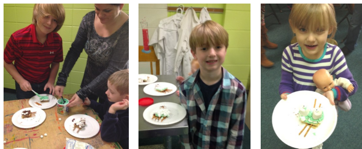
Kid's at "The River" making Lost Sheep!