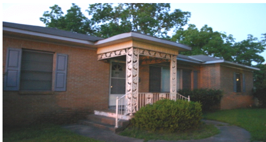
"House of Hope"

Donations from the dinner will go to Casa Esperanza "House of Hope" the wonderful ministry we have here at Kings Highway Christian Church. Casa Esperanza is a lodging space for the families of children being treated at Shriners Hospital. We do not just provide a living space for these families, we do everything we can to make them truly feel at home. Casa Esperanza helps the children and their parents relax and take a break from living in a hospital.