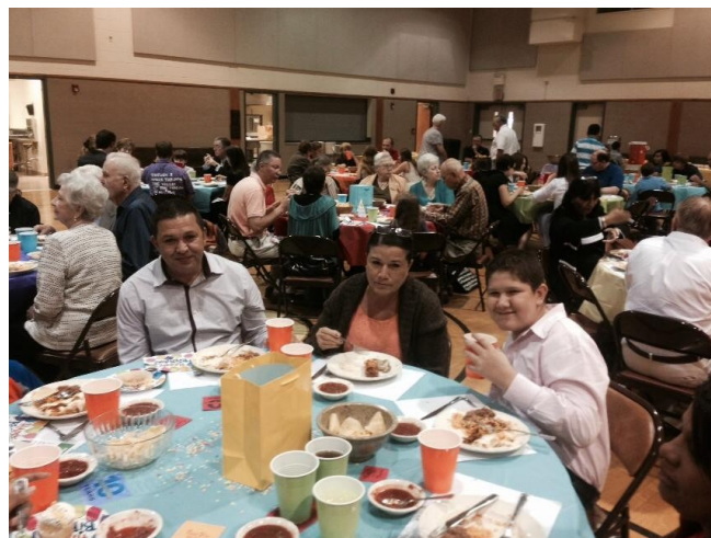
Hispanic Ministry Birthday Lunch October 12, 2014