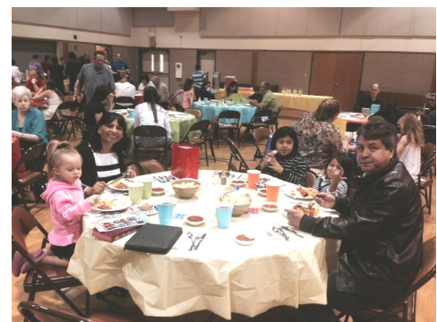
Hispanic Ministry Birthday Lunch October 12, 2014