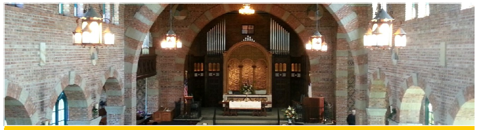
Volume XXXVII Number 36