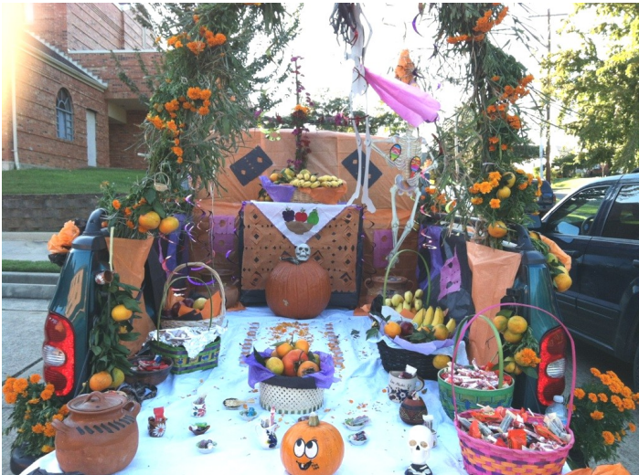
First place Trunk or Treat winner!