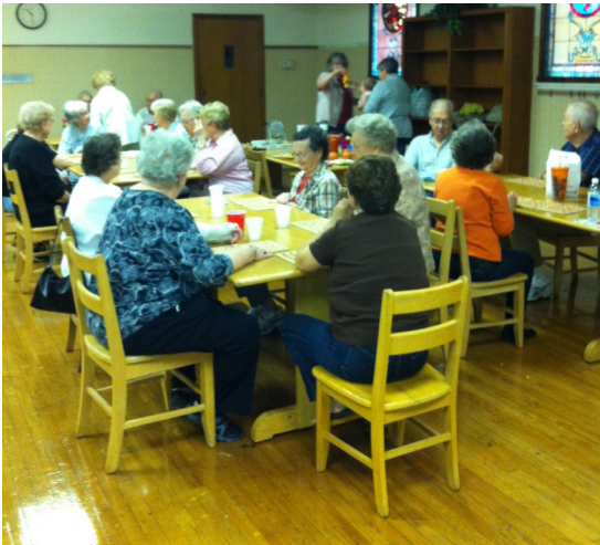
JOY Fellowship - Bingo!