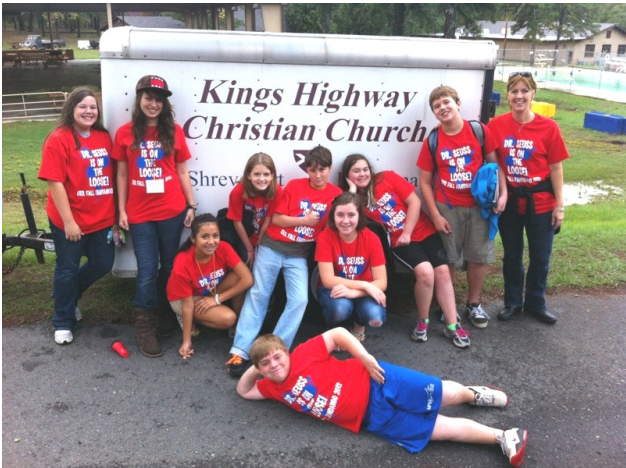
Chi Rho Fall Fandango 2012