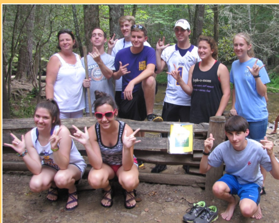
CYF SUMMER TRIP 2012

CYF Evening Activities this Sunday at 4:00 pm - 5:30 pm in the Family Life Center.