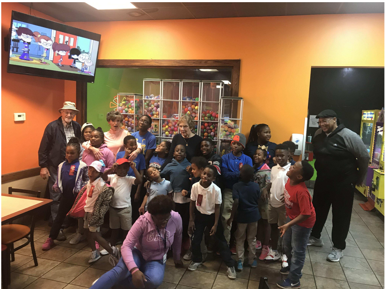
Community Renewal Friendship House Good Grade Dinner

Our budgeted giving to Disciples Mission Fund is on track, and special offering (Week of Compassion, Easter, Pentecost) are up significantly over last year. Through September, KHCC giving to the General Church (Disciple Mission Fund) and the Great River Region totaled $8,119.