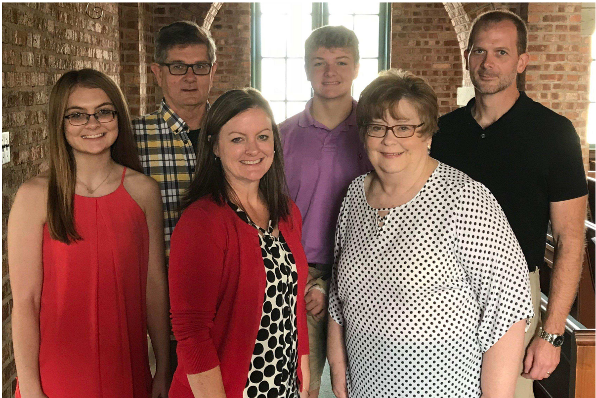
The Shreveport-Bossier Latimers at KHCC September, 2018