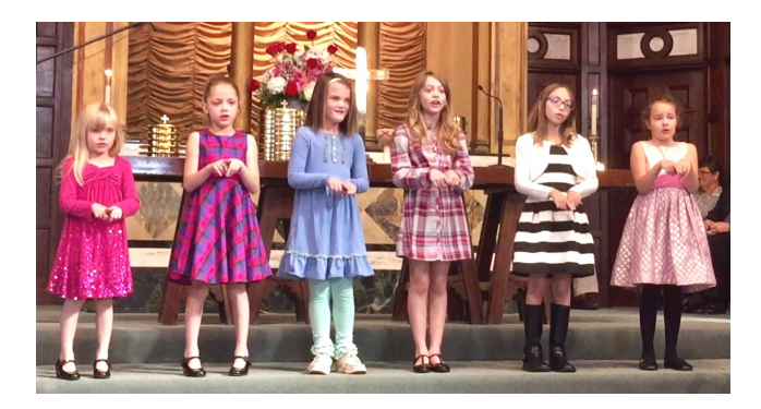
Children singing during our Combined Service.

November 3 — Bible Study & Seekers Class