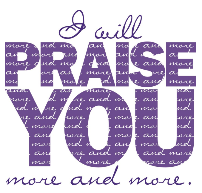
PSALM 71:14, NIV