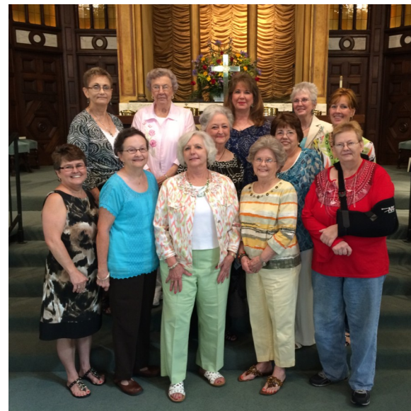
DWM Night Circle Group