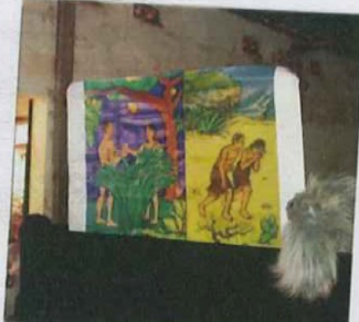
STEP 2: Each of the 12 Teams takes the pack on moped or bike to the distributions. Start with the 'chicken skit', then a puppet skit, then the Gospel. Repeat 140 times!!

STEP 3: 30,000 + kids heard the Good News that Jesus wants a relationship with them, and MANY responded!