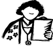
From the church nurse

I am writing this from the 2007 American Heart Association Scientific Sessions in Orlando, Florida. Today, the first day of the session has been very informative.