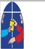
Welcome To Our Newest Members